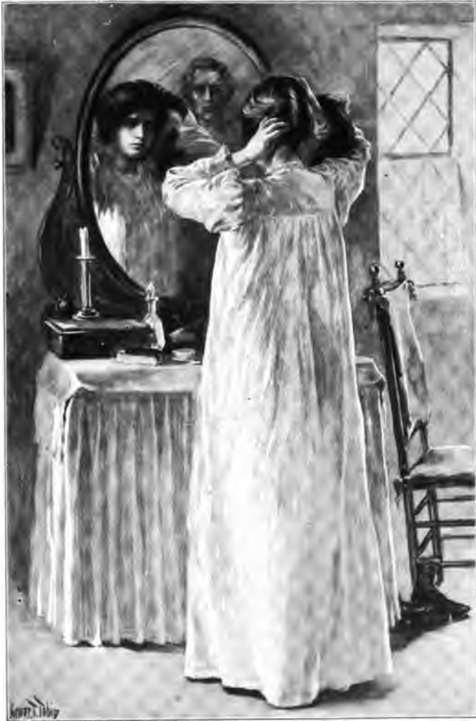
"SHE SAW HIS FACE IN THE GLASS"