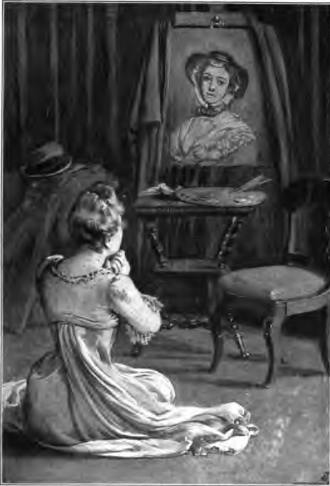
"BY SOME IRRESISTIBLE IMPULSE SHE SANK SLOWLY DOWN"