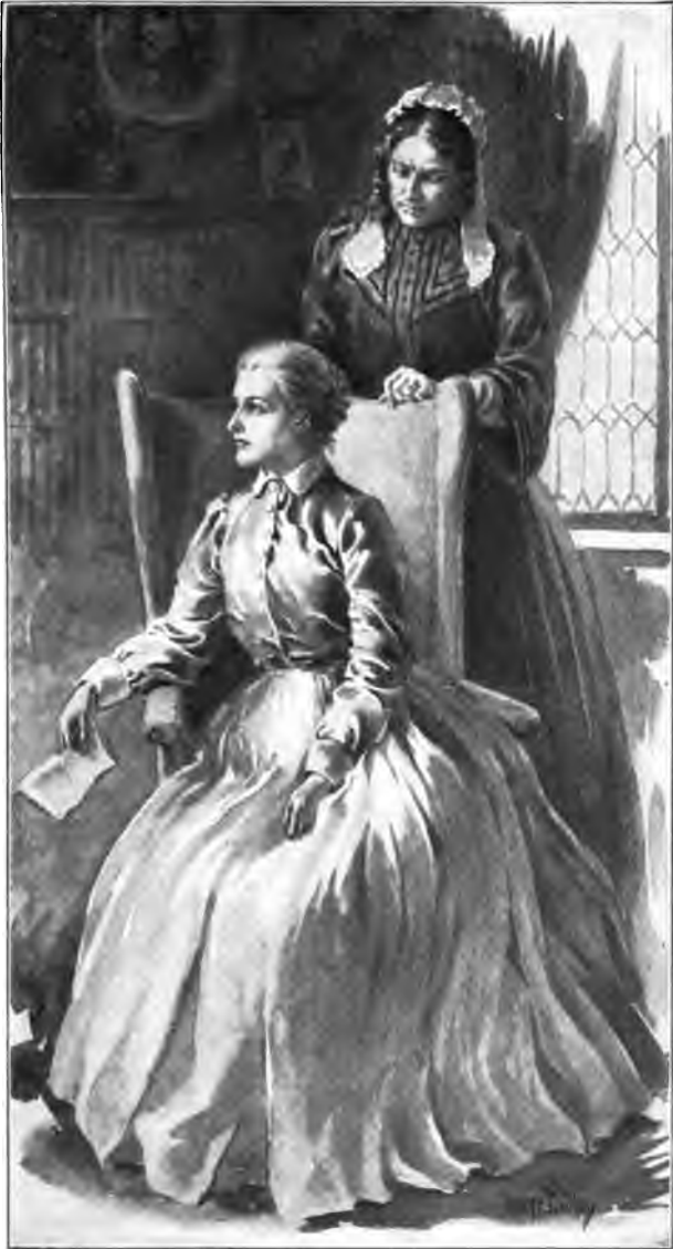
"SO SHE SAT . . . WITH HER EYES FIXED UPON THE OPEN WINDOW"