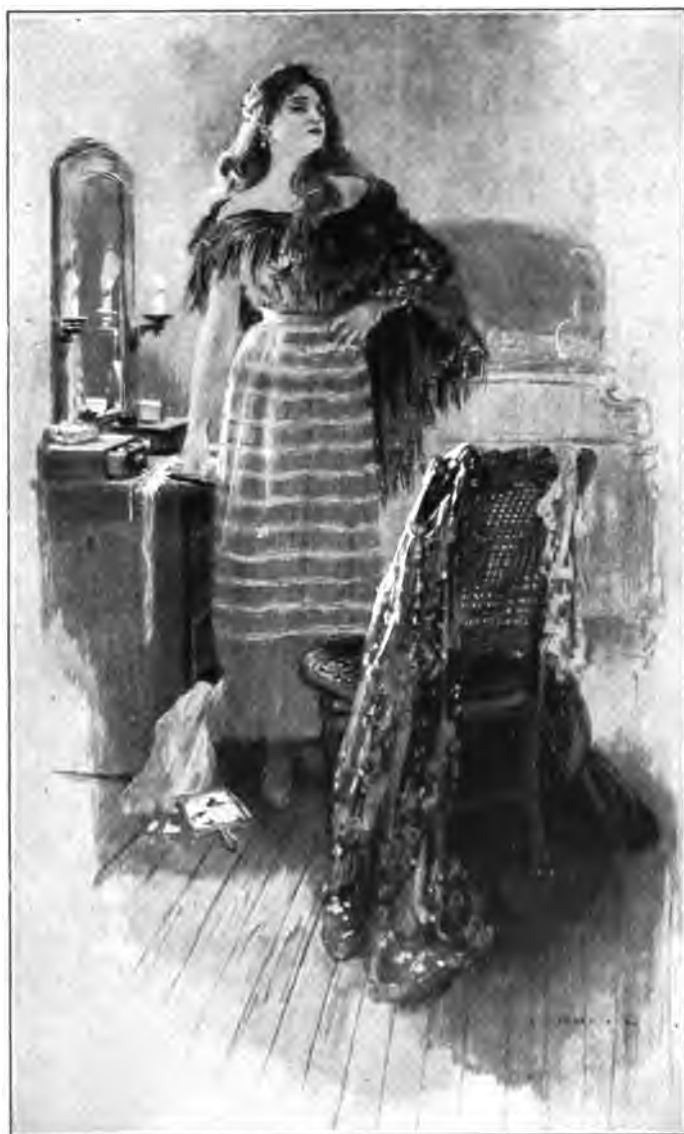
"THE DARK HYACINTHINE CURVES FELL ON HER NECK"