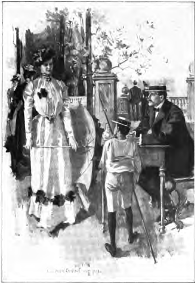
"SHE WAS STRIKINGLY, ADMIRABLY PRETTY"