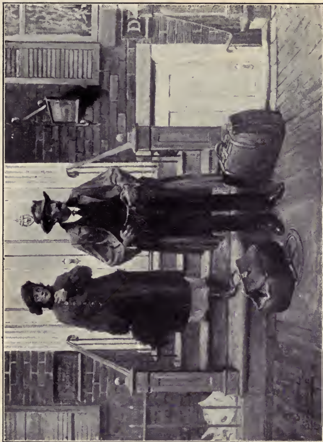
SO SHEILA ARUNDEL LEFT THE GARRET WHERE THE STARS PRESSED CLOSE AND WENT WITH SYLVESTER HUDSON OUT INTO THE WORLD