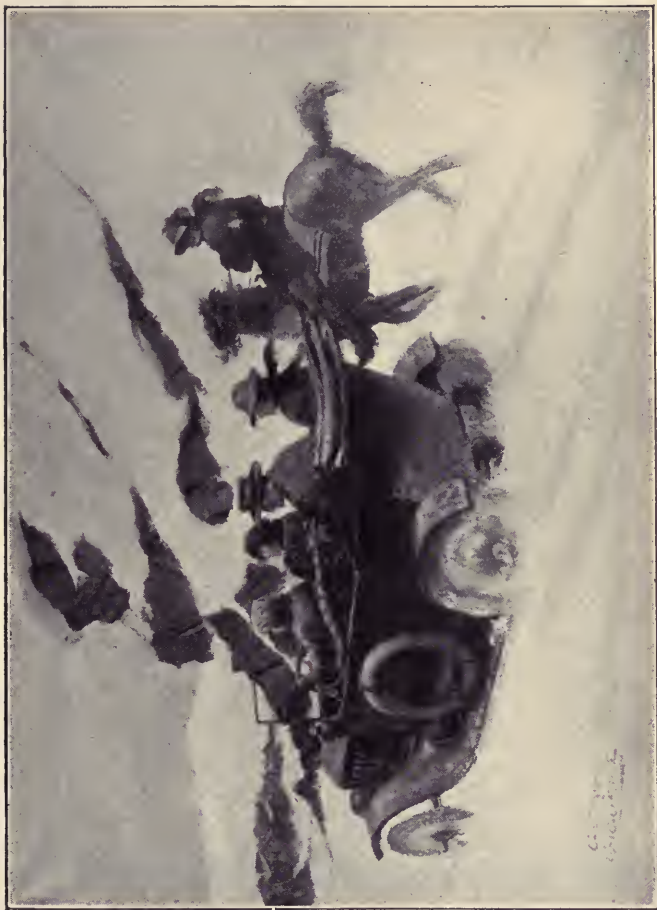
THE ONLY CAR IN SIGHT WAS HUDSON'S OWN, WHICH WRIGGLED AND SLIPPED ITS WAY COURAGEOUSLY ALONG