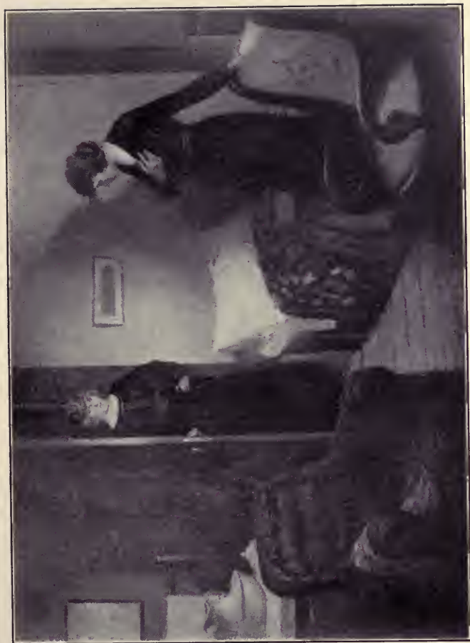
IT WAS NOT EASY, EVEN WITH BABE'S GOOD-HUMORED HELP, TO GO DOWN AND SUBMIT TO MRS. HUDSON'S HECTORING