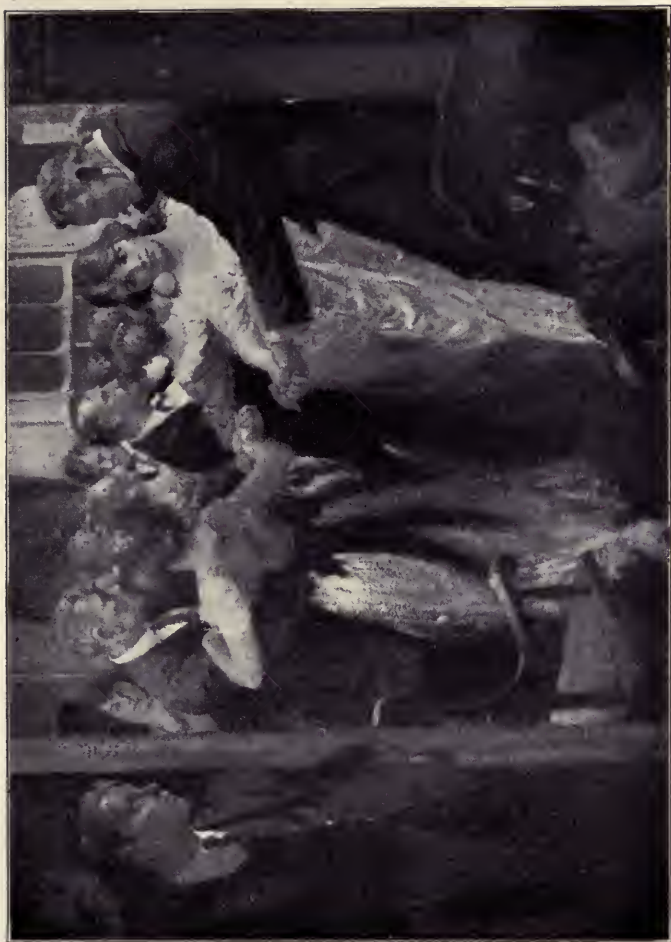
IT WAS AN INDULGENT AND FORGIVING SMILE, BUT, MEETING DICKIE'S LOOK IT WENT OUT