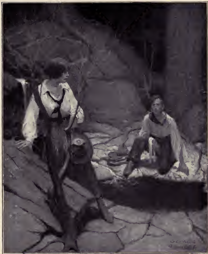
A MAN KNEELING OVER THE WATER LIFTED A WHITE AND STARTLED FACE