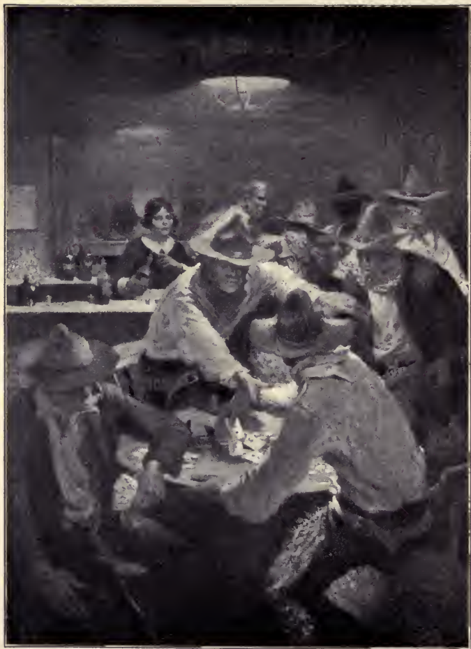
COSME'S THIN, DARK HAND SHOT ACROSS THE TABLE AND GRIPPED THE FELLOW'S WRIST (page 102)