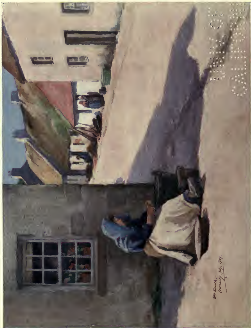
The Smith, Canterbury, July, 1841.