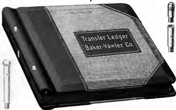
Securely Locked by mechanism in top cover. Key-hole shown in lower left hand corner of cut.

PATENTED MARCH 17, 1897. DECEMBER 19, 1899.