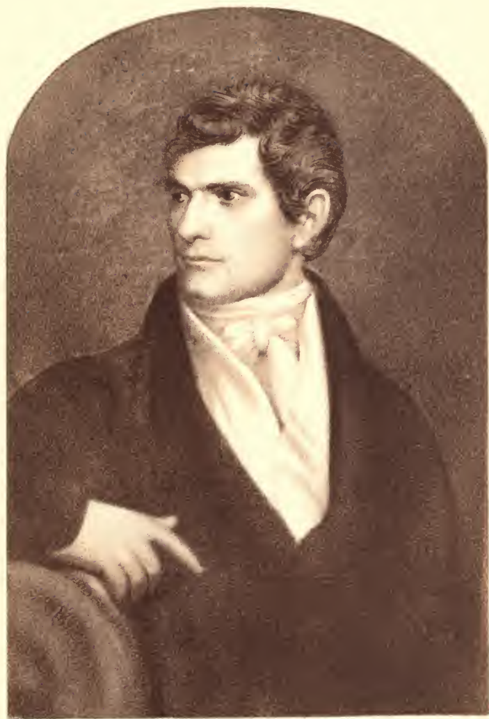
JOHN C. CALHOUN

in early life from an original portrait in the possession of the family