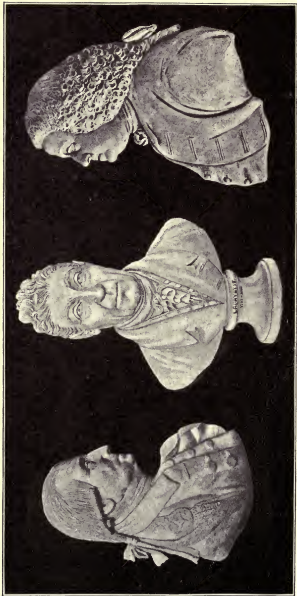
Washington, Lafayette, and Franklin. From the originals in possession of the Historical Society of Pennsylvania and the American Philosophical Society.