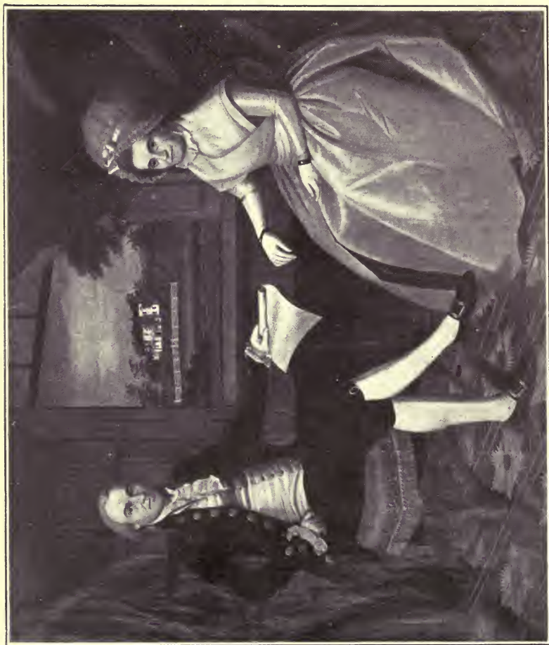
Oliver Ellsworth and his wife. After the original painting in the Wadsworth Atheneum, Hartford, Connecticut.