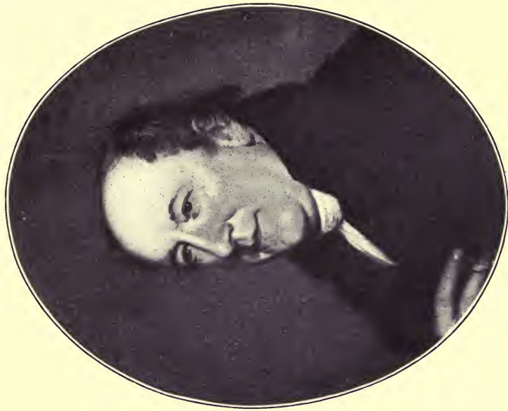
Rufus King. By Charles Willson Peale. Both of which are now in Independence Hall, Philadelphia.