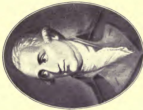
Peter Muhlenberg, of Pennsylvania.

From the originals in Independence Hall, Philadelphia.