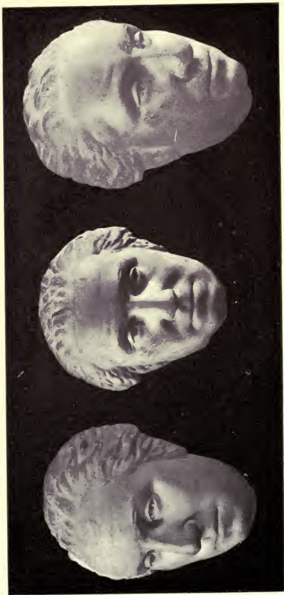
Three views of the life-mask of Washington. From the original in possession of the Historical Society of Pennsylvania.