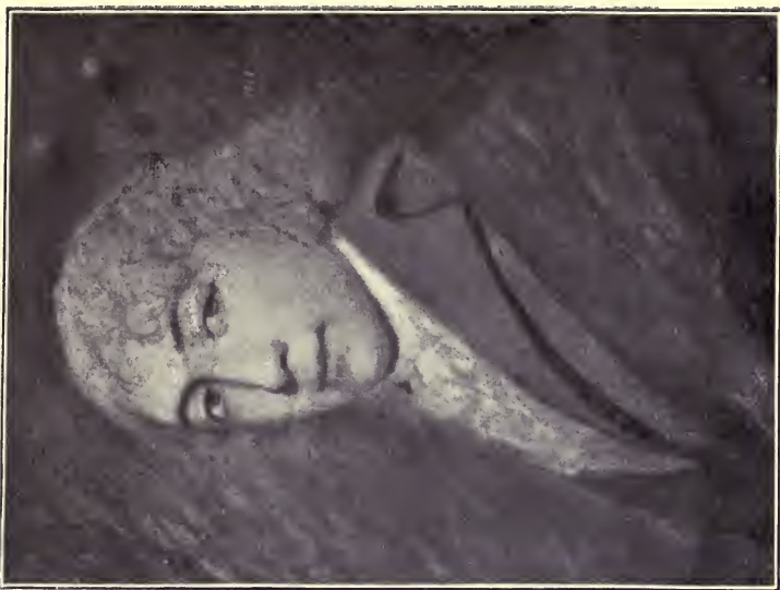
Chevalier d'Yrujo, Minister from Spain.

From the crayon drawings by James Sharpless, in Independence Hall, Philadelphia.