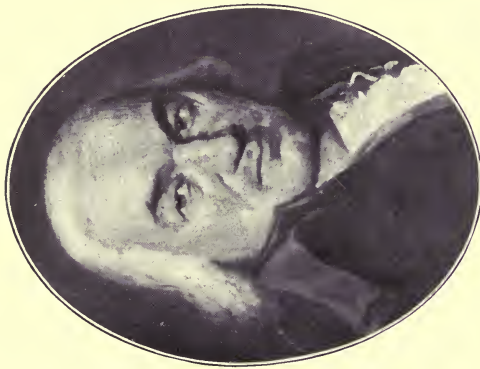
Oliver Ellsworth, of Connecticut.