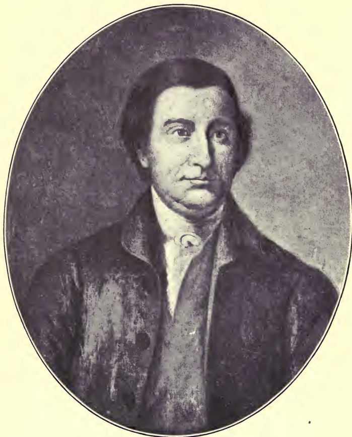
Edmund Randolph. From the original painting in the State Library, Richmond, Virginia.