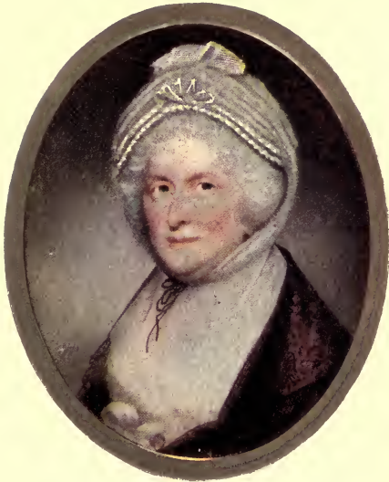
Martha Washington. From the miniature by James Peale, now in possession of the Historical Society of Pennsylvania.

Copyright, 1904, by George Barrie & Sons.