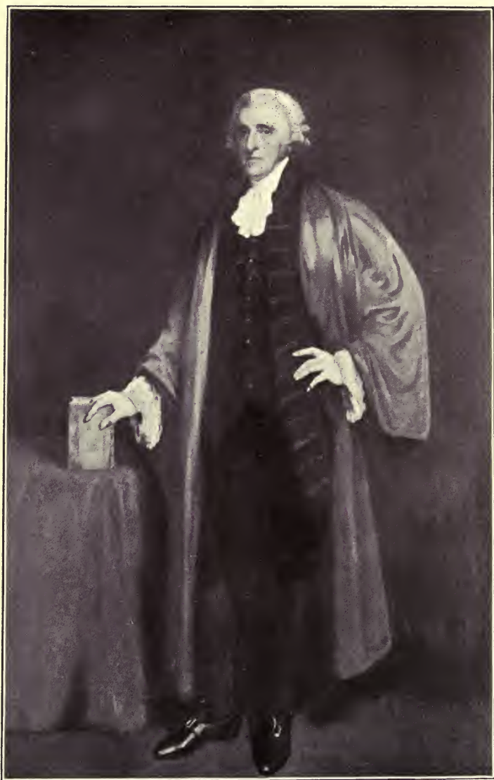
Thomas McKean. From the painting in Independence Hall, Philadelphia.