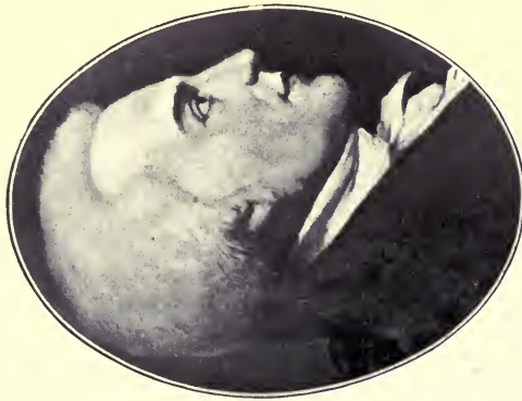
William Richardson Davie, Minister to France.