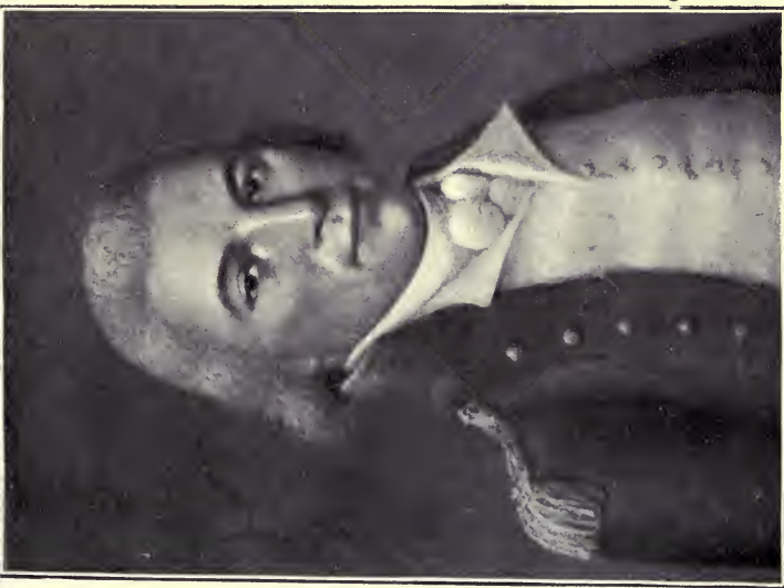
Pierre Adet, Minister from France.

From the crayon drawings by James Sharpless, in Independence Hall, Philadelphia.