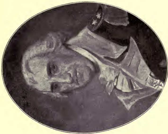
Charles Cotesworth Pinckney.