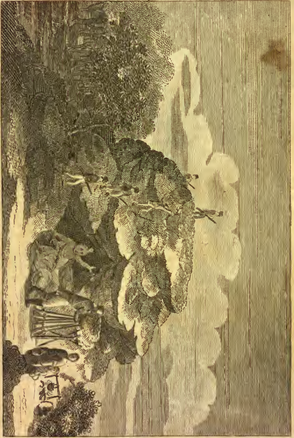
CAPTIVITIES OF ANNAWON.