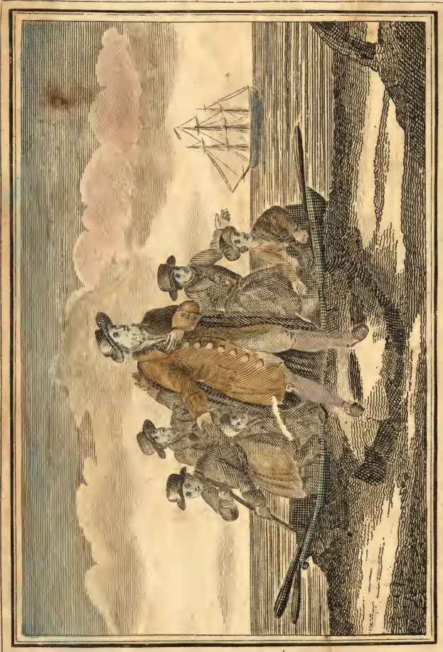
LANDING OF THE PILGRIMS AT PLYMOUTH.