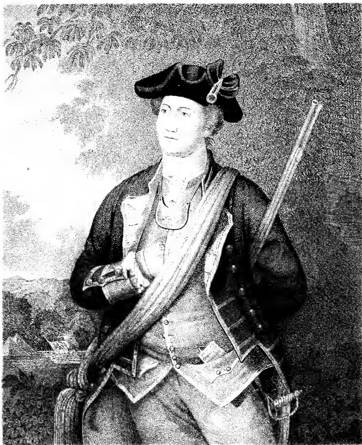
CW Peale Pinxt