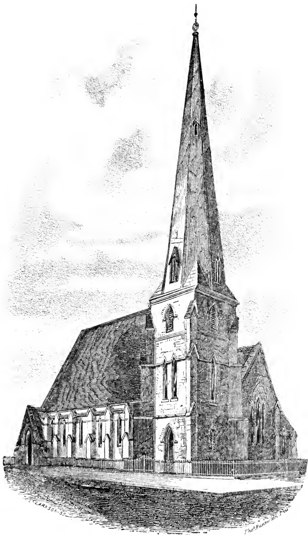
CALVARY MONUMENTAL CHURCH.