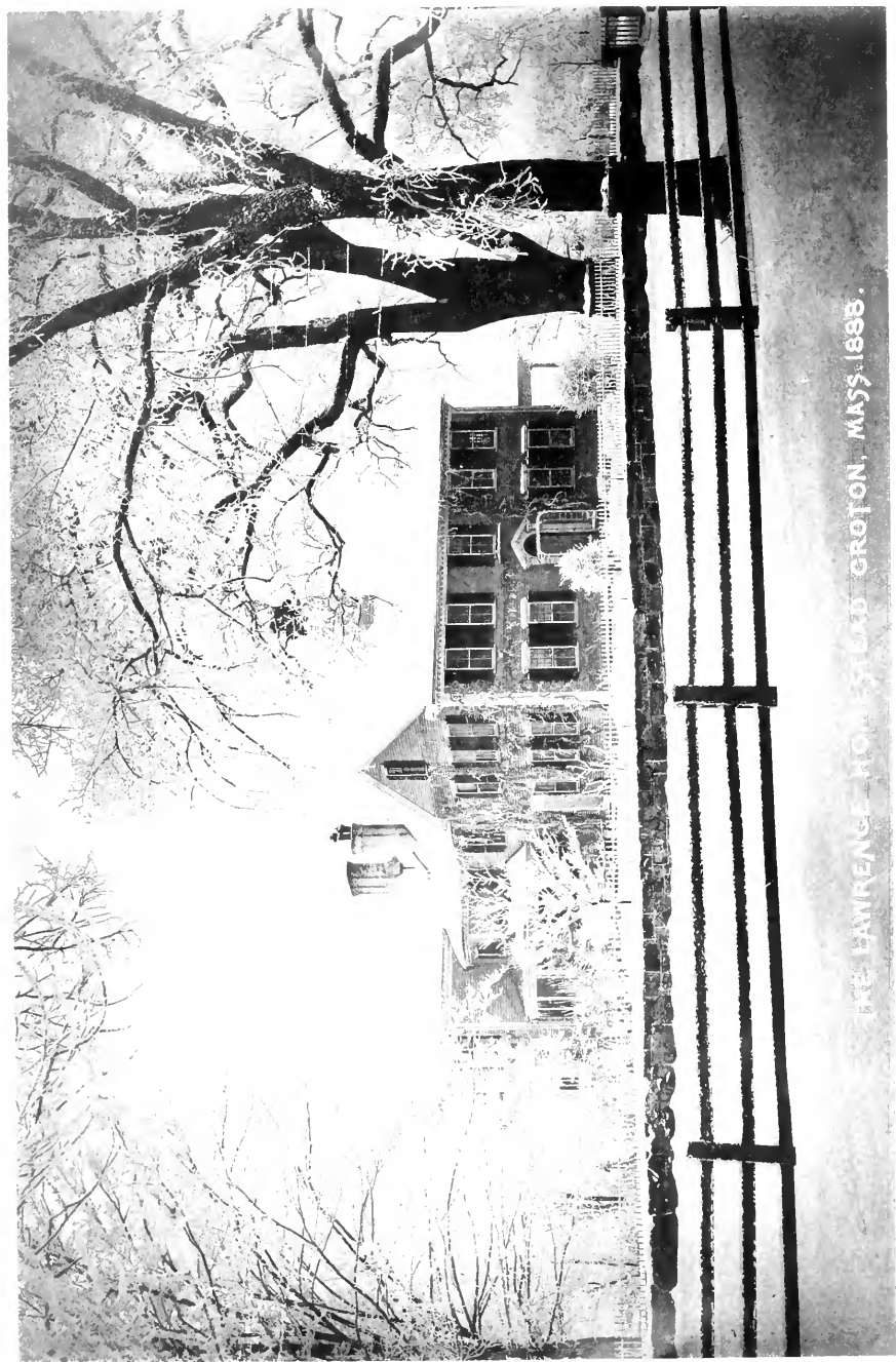
THE LAWRENCE HOMESTEAD GROTON, MASS., 1888.

SHOWING THE OLDER PART OF THE HOUSE. BUILT ABOUT THE YEAR 1740.