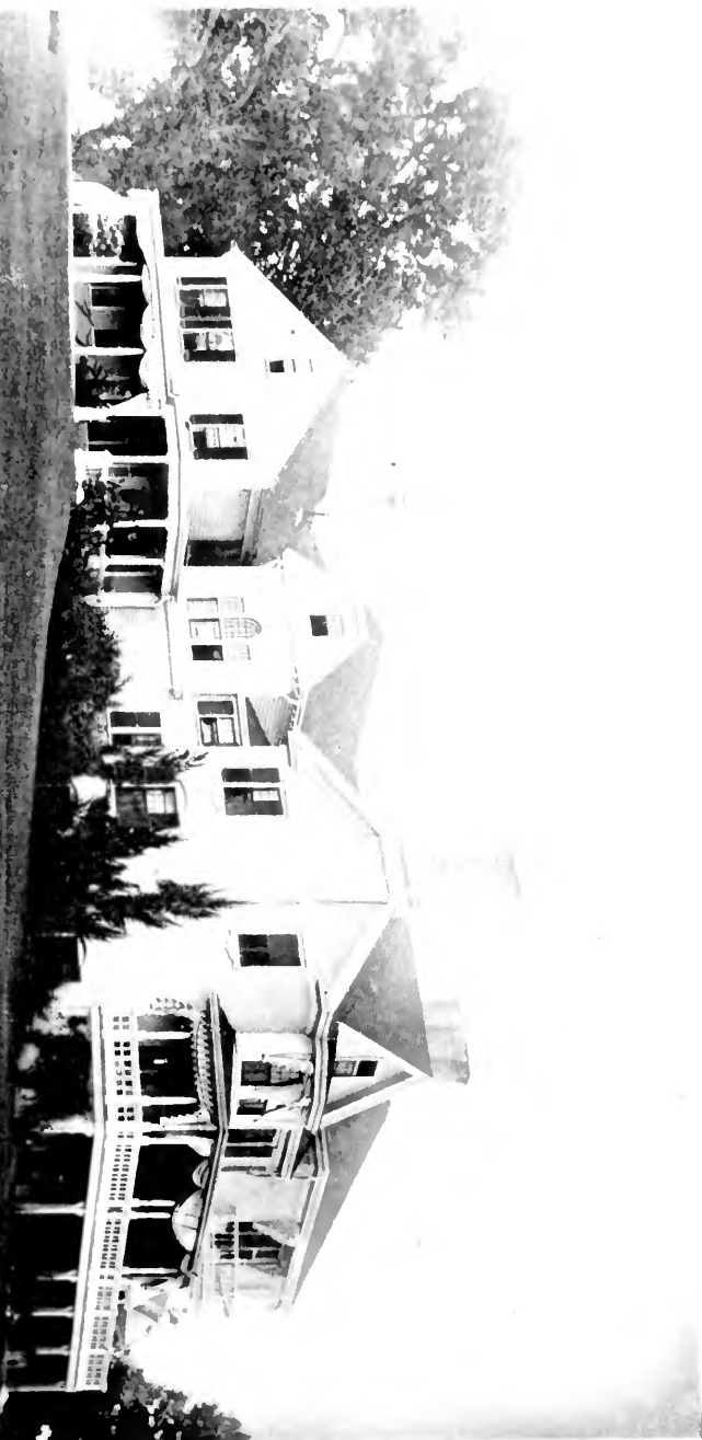
THE LAWRENCE HOMESTEAD, GROTON, MASS. 1888.