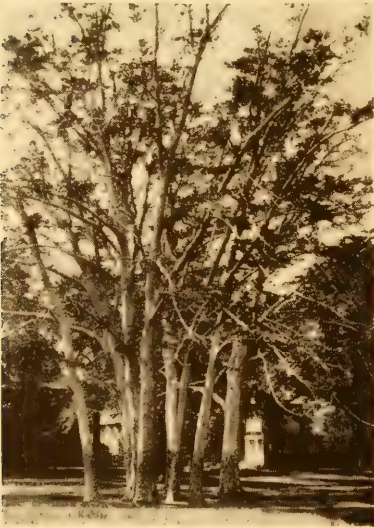
By Otto Olmberger, 270 50th St., Brooklyn

The Twelve Apostles Silver Beech trees, corner of 74th Street and Ridge Boulevard, Brooklyn. The trees bear dates cut in them 1710 and 1722, and it is said they were a guide to ships when they came around the point from what is now Coney Island.