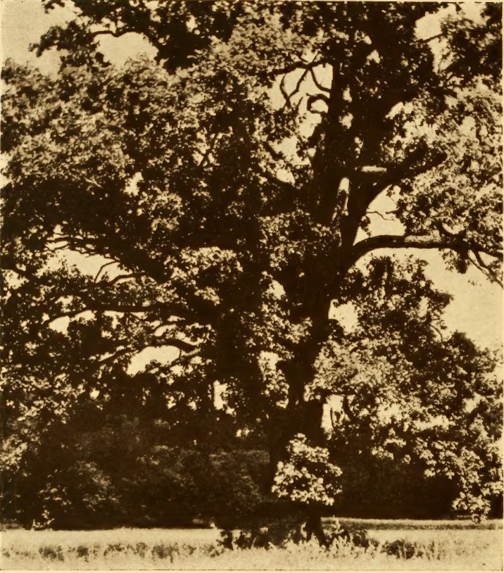
Submitted by F. H. Jackson, Manufacturers National Bank, Troy

THE Board of Indian Commissioners headed by Governor Andros and his councillors, judges, and divines, accompanied by the militia of the King of England, assembled near the confluence of the Tomhannac with the Hoosac and planted at Schaghticoke, Rensselaer County, the Witenagemot Oak. The famous Council Tree of Peace was planted, not only with a view of confirming the link of friendship between Kryn's "Praying Mohawks" of the Caughnawaga village in Canada and Soquon's Hoosacs, but to strengthen the alliance of the Fort Albany militia with their river Indian scouts, whose fugitive kindred were scattered throughout New England, New York, and New France. It is the only "Vale of Peace" on the continent where the Witenagemot (Assemblage of the Wise) ever assembled for the Indian's welfare. Won $5.