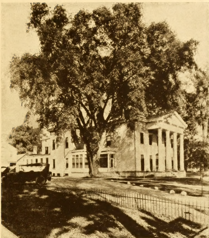
Submitted by Charles M. Omart, Rome

THIS tree was spoken of by historians as a sapling in 1804 and stood in Fort Stanwix. A fort erected by the English Government in 1758 and taken possession of by the American troops in 1776 and from which the first American flag was flown August 6, 1776. Also in this fort the treaty was signed between the Iroquois Indians and the United States by which they signed a vast portion of their lands in the West to the U. S. in 1788.