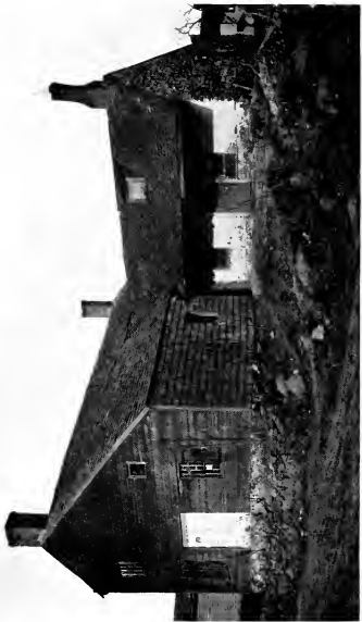
Old Husted Homestead at Williamsbridge, New York, of Revolution Fame