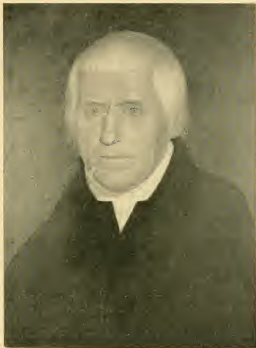
LIEUT. ISAAC DAVIS 6TH MASS. REGIMENT