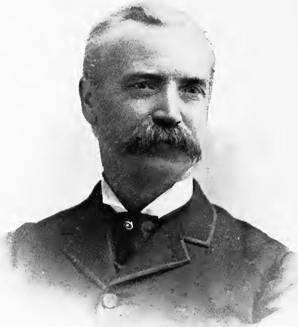
John Couant Long