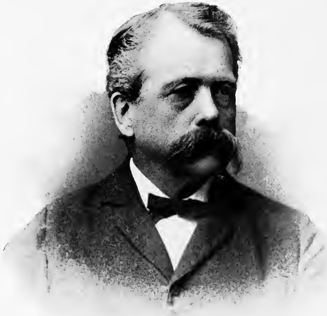
James Monroe Flower