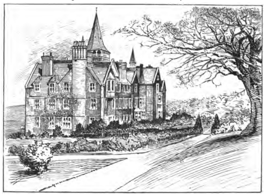
CHURCH MISSIONABIES' CHILDREN'S NEW HOME, LIMPSFIELD, 1887.

So we close the record of those Three Memorable Years. It is the Lord's doing, and it is marvellous in our eyes!