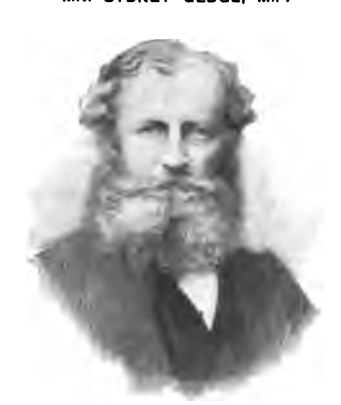
GENERAL LAKE, C.S.I.