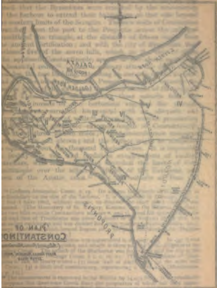
PLAN OF CONSTANTINOPLE

country. The seat of Turkish jurisdiction is situated The distance of a Constantinople. The distance from the