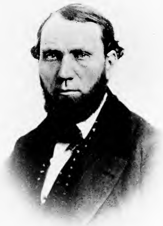
ALLAN PINKERTON 1860