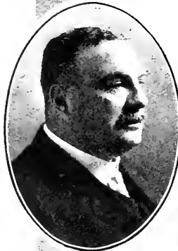
COL. ROBERT E. LEE