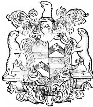
BETHUNE OF BALFOUR.