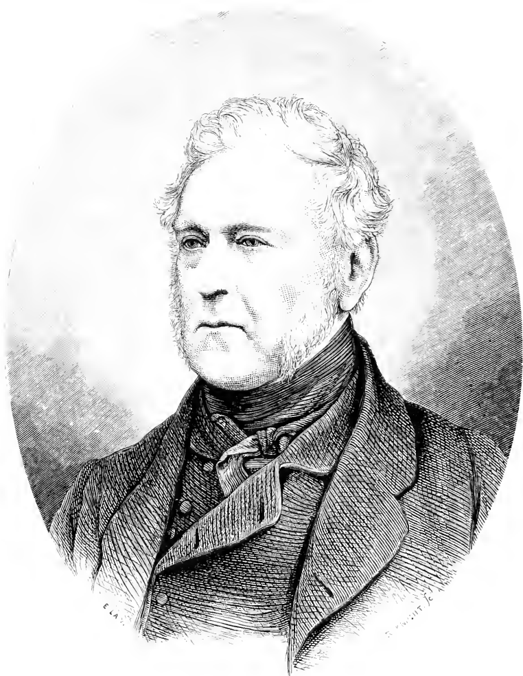
THE HON. ADMIRAL ROUS.