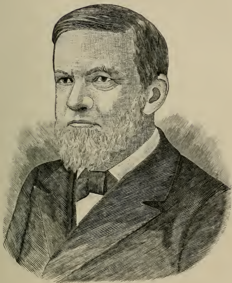
John Albert Broadus.