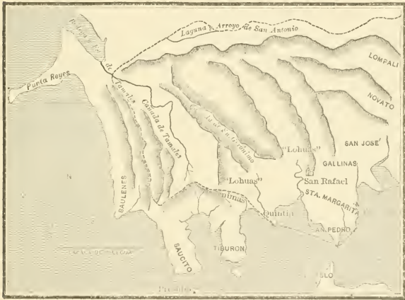
MAP OF S. RAFAEL LANDS IN 1834.

ber of neophytes in 1834 must have been about 500, a decrease of about 50 per cent since 1830; and in 1840 there were 190 Indians living in community with probably 150 scattered. The valuation in 1834 was $18,500, or deducting real estate and church property, $4,500 in excess of debts; two years later the debt seems to have considerably exceeded the available assets, though this fact is somewhat misleading as an indication of the actual state of affairs. A large por-