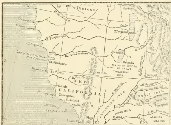
MAP OF 1826.

that the party sent back from Fort Vancouver to avenge Smith's disasters was under the command of McLeod, and after recovering the stolen furs, traps, and horses, was guided by Turner down into the Sacramento Valley in 1828, where he made a successful hunt. Returning northward, however, he was overtaken by a snow-storm in the Pit River country, which he was the first to traverse. 23 He lost his animals, and was compelled to leave his furs, which were spoiled by melting snow before they could be moved.