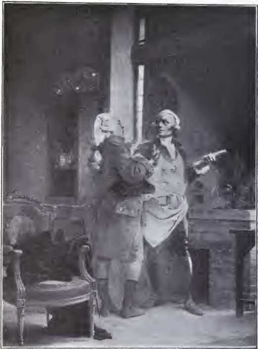
LAVOISIER AND BERTHOLLET in the Laboratory of the Sorbonne, Paris.