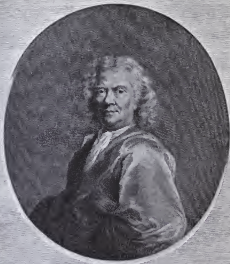
HERMANNUS BOERHAAVE Medicinæ, Botanicæ, Chemicæ & Collegii practici, in ACAD. LUGD. BAT. PROFESSOR ORDINARIUS.