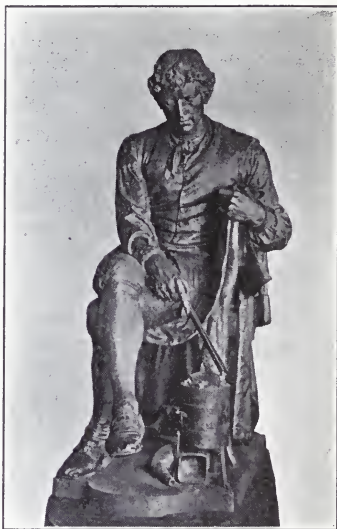
CARL WILHELM SCHEELE.

Of the Swedish chemists of that period, the most notable was Scheele.