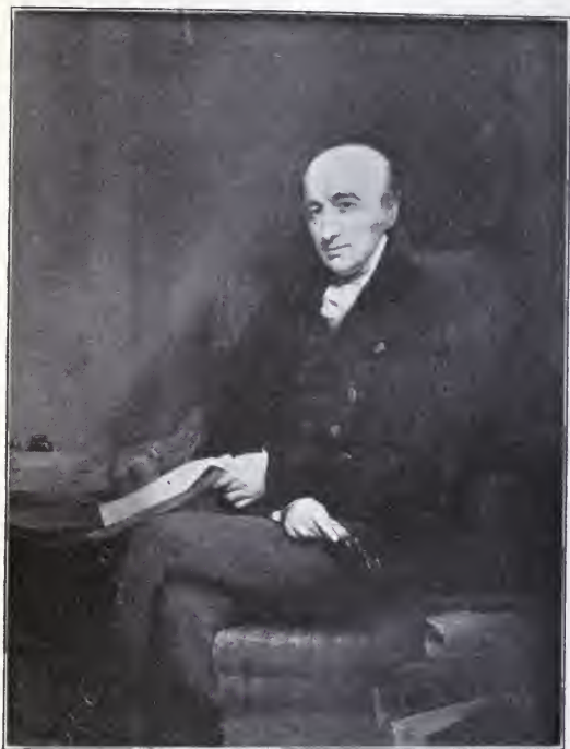
WILLIAM HYDE WOLLASTON.

From a painting by J. Jackson, R.A., in the possession of the Royal Society.