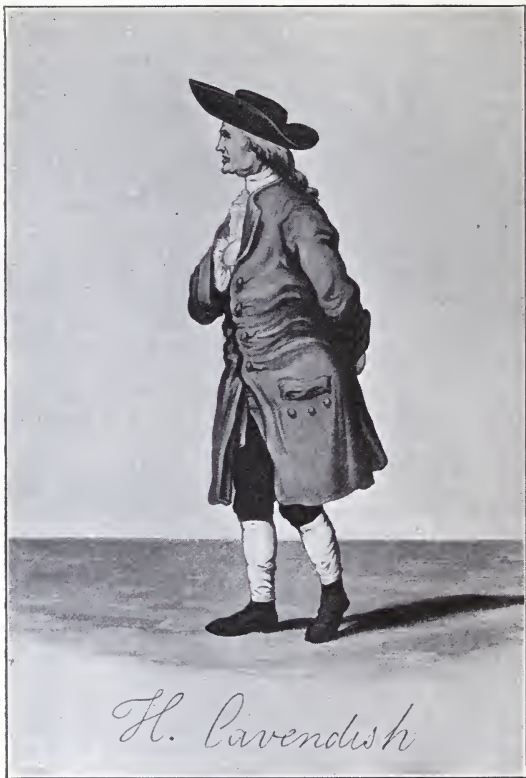
From a drawing by Alexander in the Print Room of the British Museum.