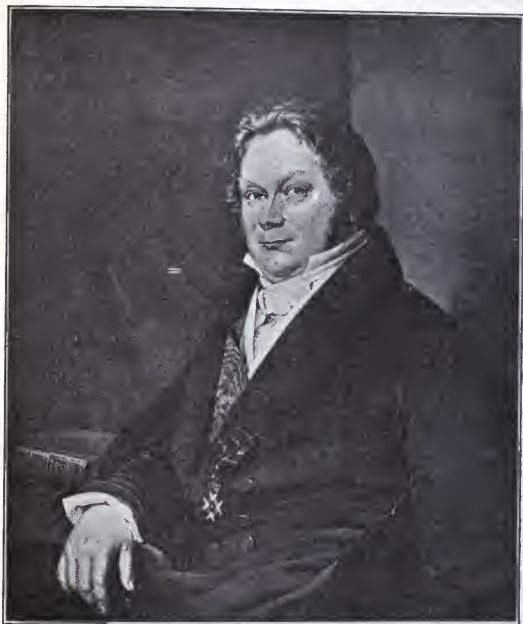
JÖNS JAKOB BERZELIUS. From a painting by J. G. Sandberg.