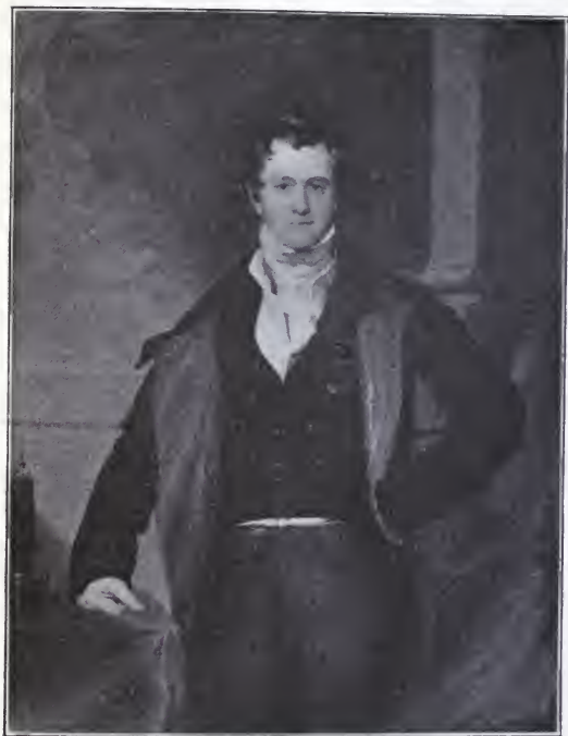
SIR HUMPHRY DAVY.

From a painting by Lawrence in the possession of the Royal Society.