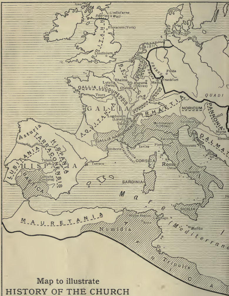
Map to illustrate HISTORY OF THE CHURCH