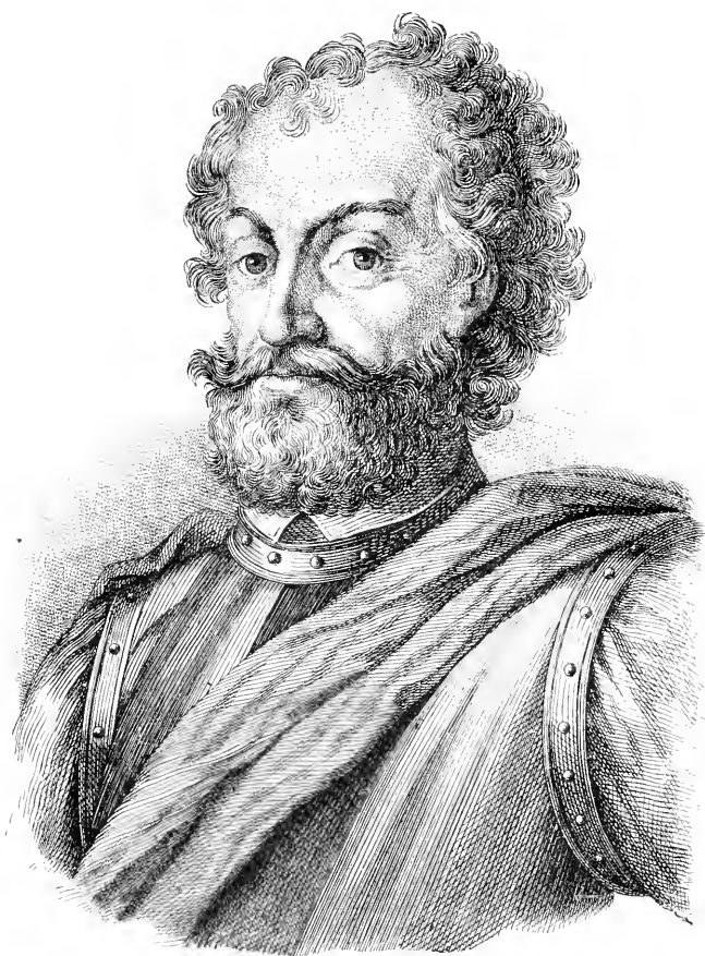
WENZEL VON BUDOWA.