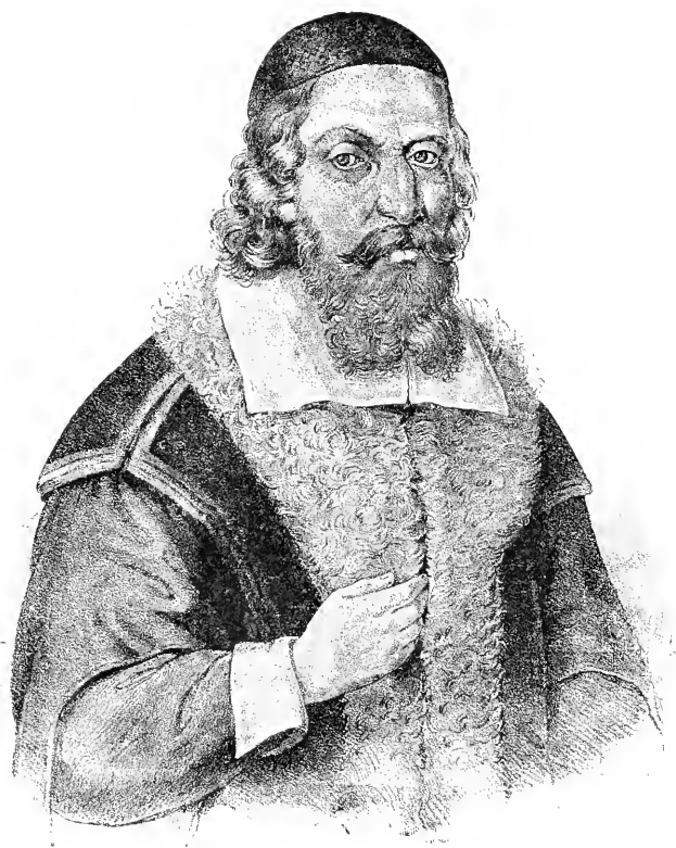
JOHN AMOS COMENIUS.