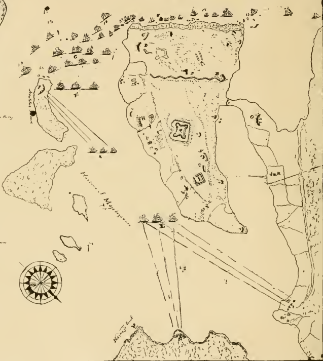
MAP OF BATTERIES.