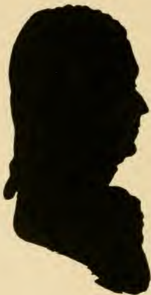
GEN. PELEG WADSWORTH.