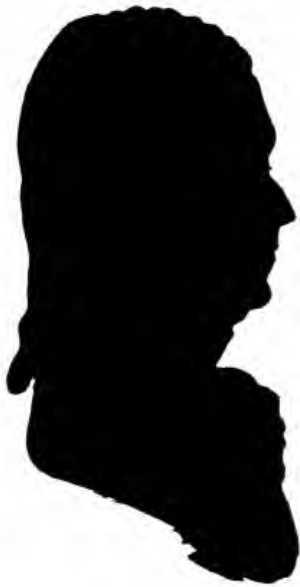
GEN. PELEG WADSWORTH.