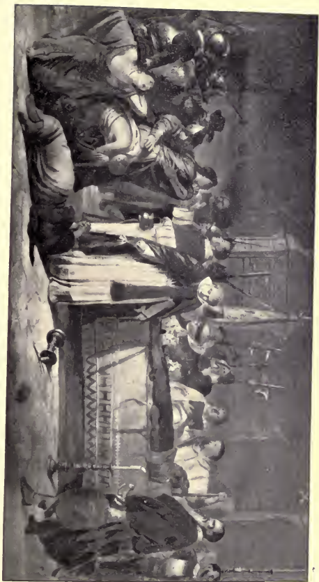
DEATH OF ATAHUALPA, FROM A PAINTING IN THE CATHEDRAL AT CALLAO.