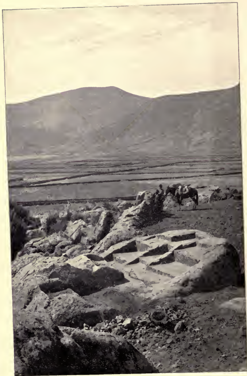
ANCIENT INCA SEAT OF JUSTICE.