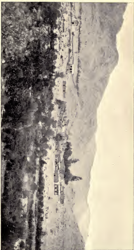
RUINS OF THE FIRST SPANISH SETTLEMENT.