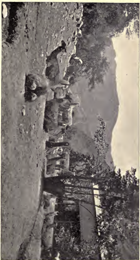
A GROUP OF LLAMAS.