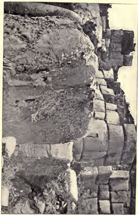
RUINS OF AN INCA TEMPLE.