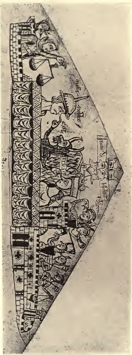
FACSIMILE OF A CARICATURE ON A ROLL (ROTULUS JUDEFORUM, A.D. 1233) IN THE PUBLIC RECORD OFFICE.