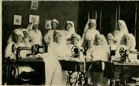
LADIES OF THE EASTERN STAR PEELING FIFTEEN BUSHEL OF POTATOES FOR THE BERGU (Upper)