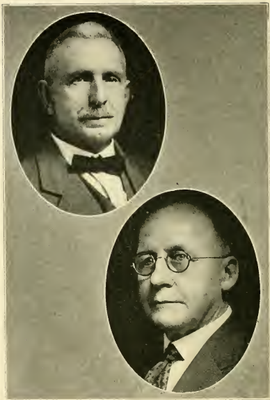
JAMES E. MENDENHALL Mayor of Greensburg at the Beginning of the War