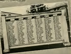
DECATUR COUNTY'S HONOR ROLL BOARD AT GREENSBURG