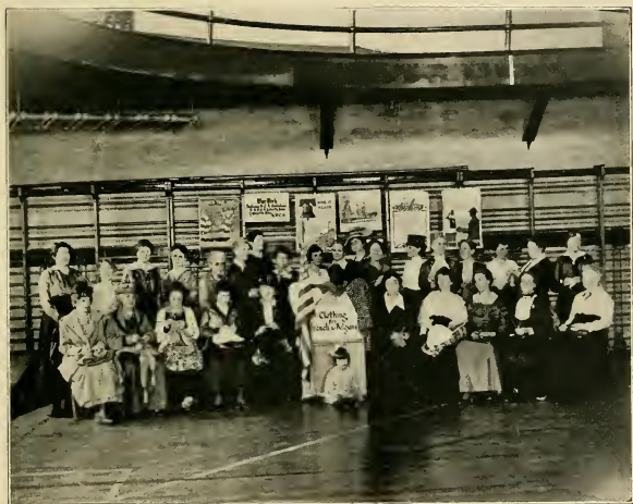
DAUGHTERS OF AMERICAN REVOLUTION, GREENSBURG, DECATUR COUNTY