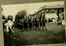
SURGICAL DRESSING WORKERS, JULY 4, 1918