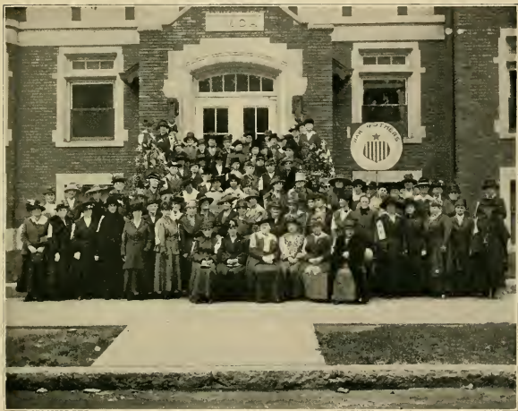
THE WAR MOTHERS OF DECATUR COUNTY