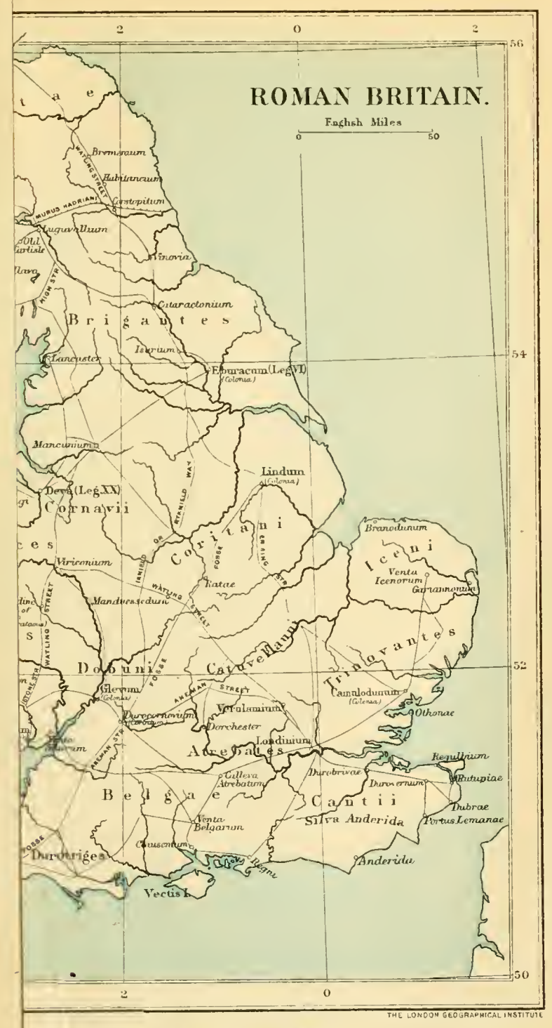
London, New York, Bombay, Calcutta & Madras.