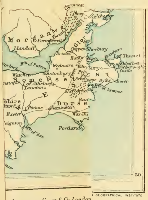
Longmans. Green & Co. London