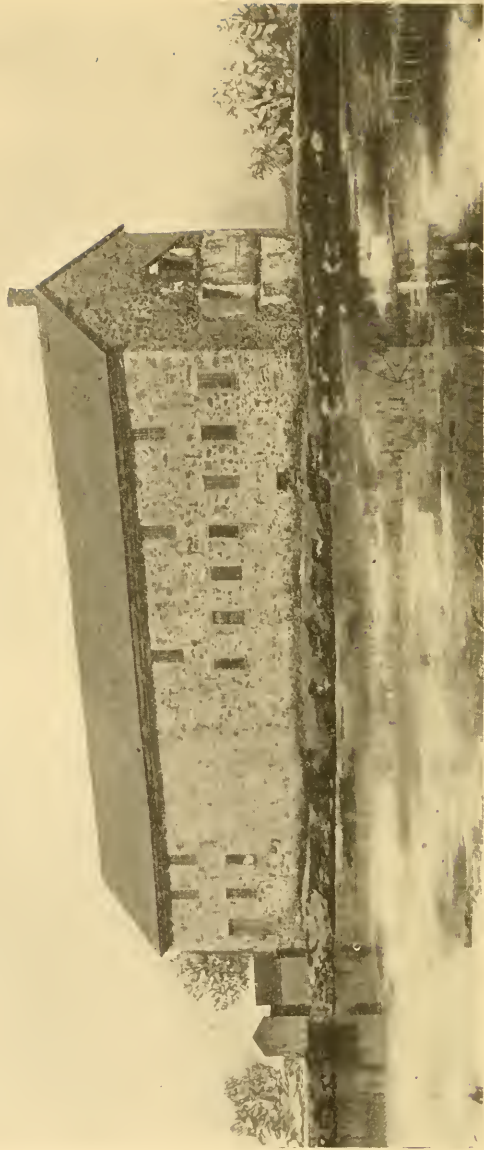
"GLOBE COTTON MILL," ERECTED 1811