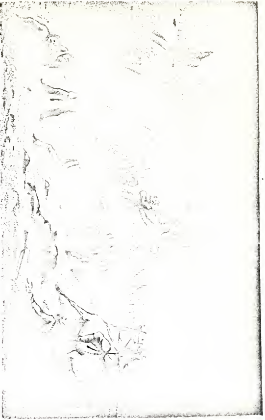
The Charge at Rappahannock Station.