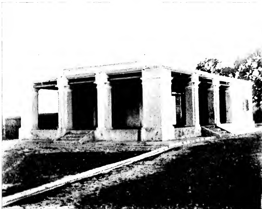
Widows' Home, Superintendent's House.