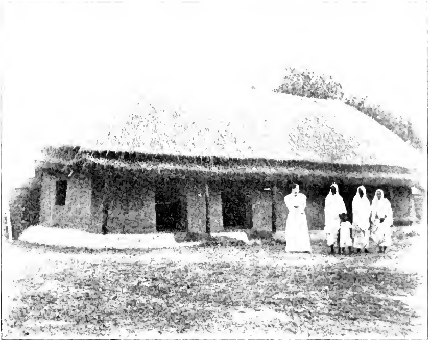
Widows' Home—Women's House, within the Compound.

This society was the fourth organization to join the council. The president and delegate have attended each triennial of the council, and at most of the annual executive sessions some representative has been actively present. By this affiliation the National Free Baptist Woman's