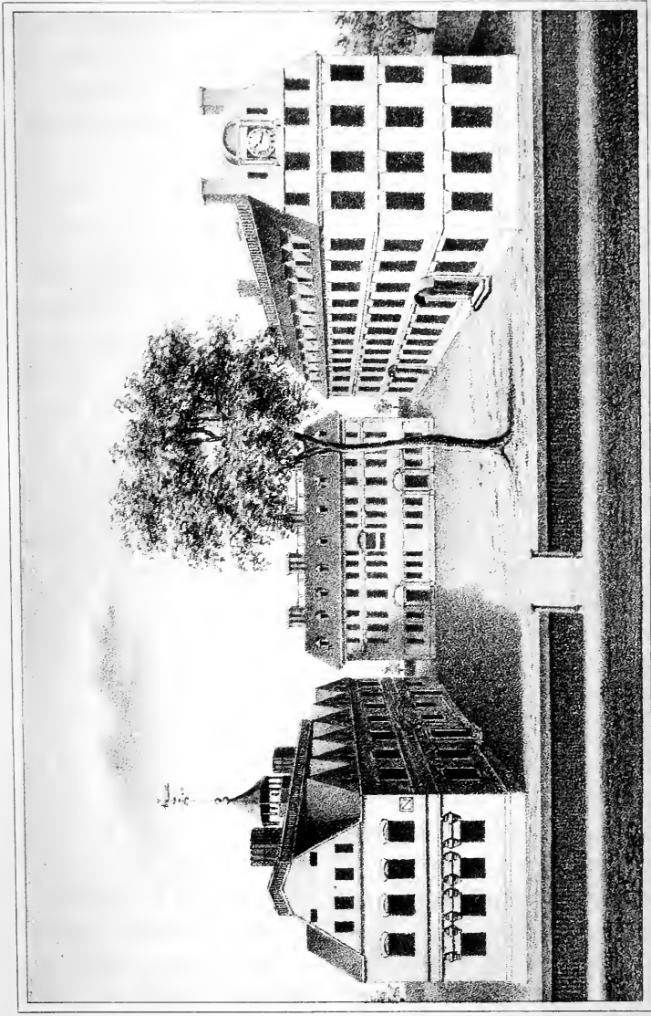
N o 1. Built in 1675.