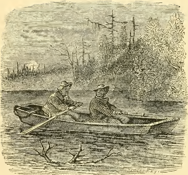
Gov. REEDER'S ESCAPE DOWN THE MISSOURI RIVER IN A SKIFF