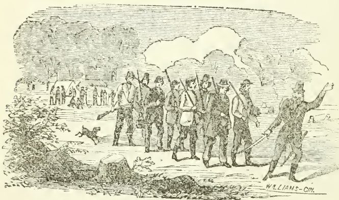
JOHN BROWN STARTING OUT TO BEGIN THE WAR.