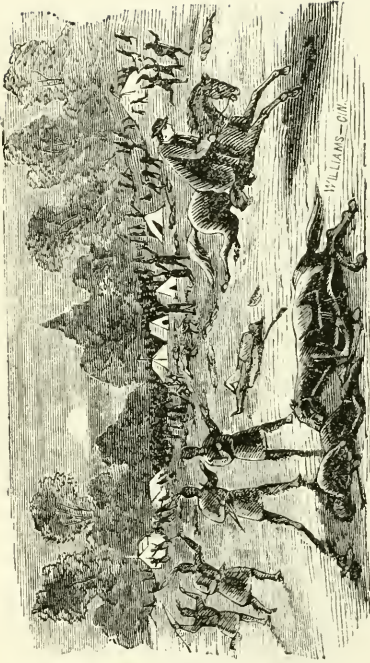
MASSACRE OF THE SPANIARDS.