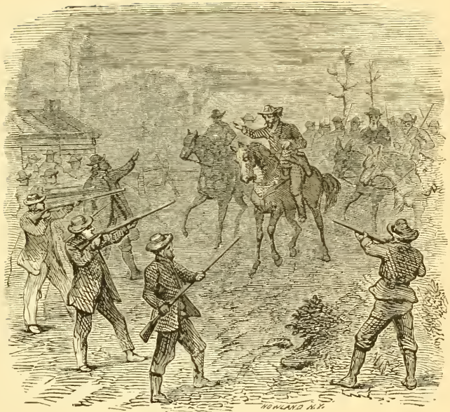
"RESCUE OF BRANSON."