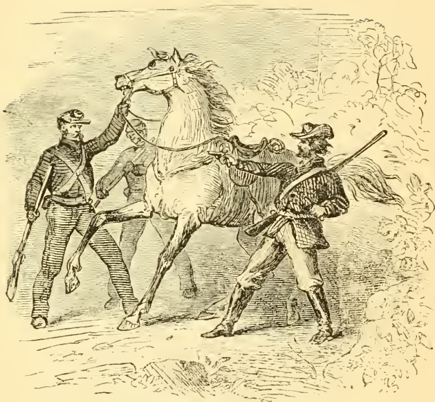
MONTGOMERY AND THE MILITIA