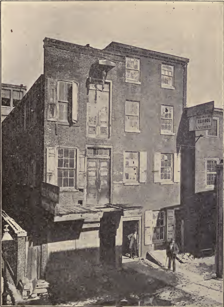
THE PHILADELPHIA SCHOOL OF ANATOMY.