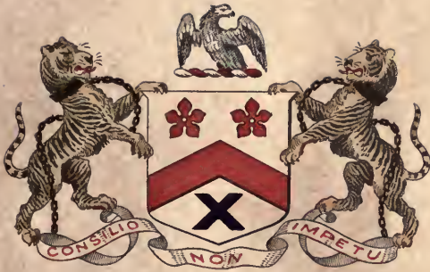
THE AGNEW COAT OF ARMS.