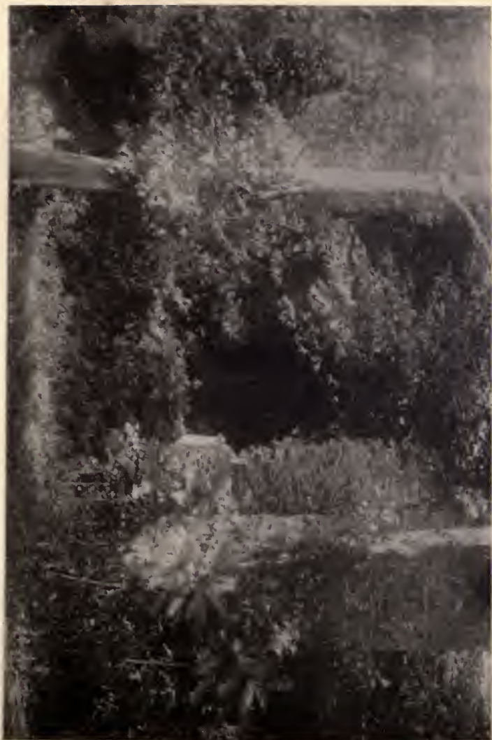
THE CHARCOAL-HOUSE OF THE PLEASANT GARDEN IRON-WORKS.