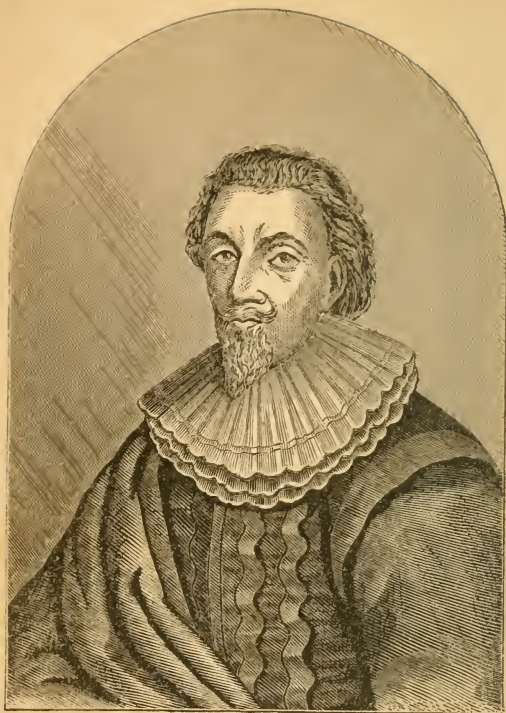
GEORGE CALVERT, First Lord Baltimore.