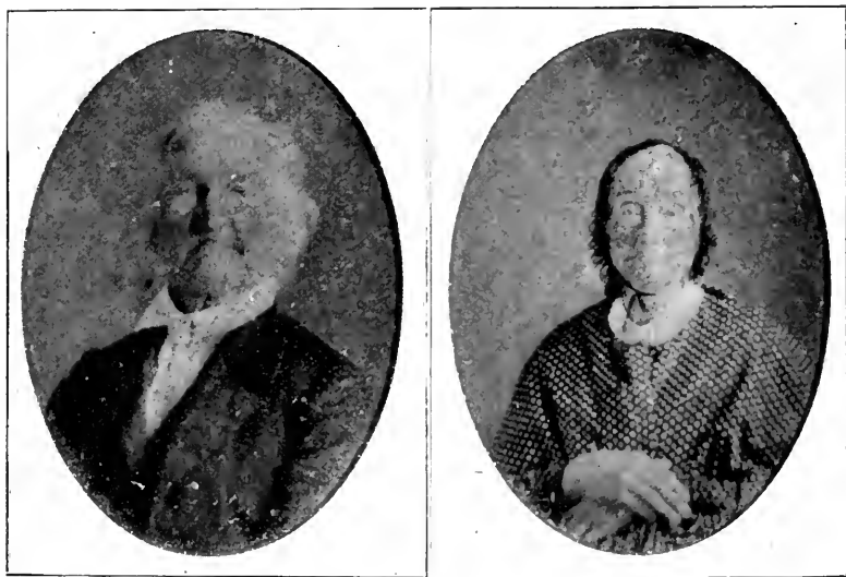
GRANDFATHER AND GRANDMOTHER BROWN.