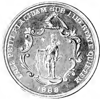
MEDAL COMMEMORATING THE TWO HUNDRED AND FIFTIETH ANNIVERSARY OF THE ANCIENT AND HONORABLE ARTILLERY COMPANY