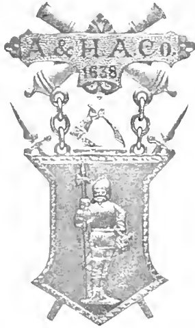
BADGE OF ANCIENT AND HONORABLE ARTILLERY COMPANY ADOPTED JAN 30, 1888.