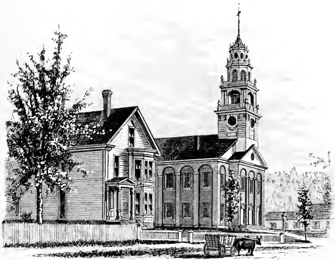
CONGREGATIONAL CHURCH AND PARSONAGE.