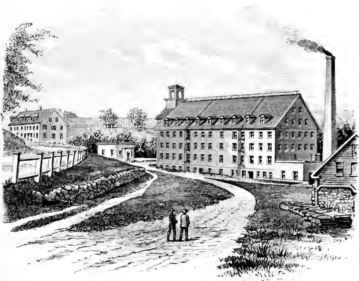
SUGAR RIVER MILLS.