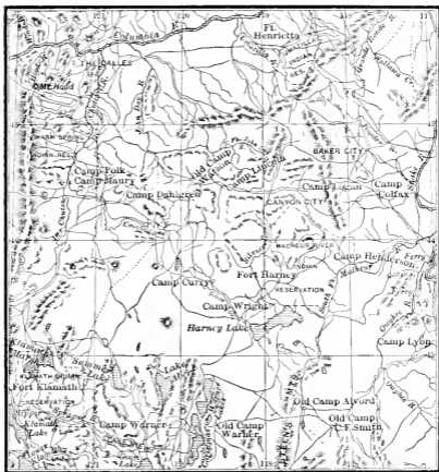
EASTERN OREGON, CAMPS AND FORTS.