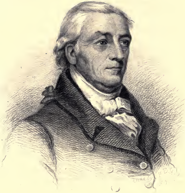
COLONEL HENRY RUTGERS.