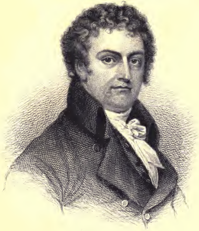
DE WITT CLINTON.