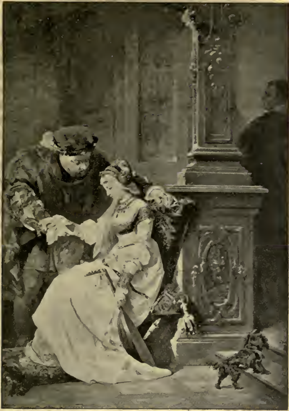
HENRY VIII. AND ANNE BOLEYN.