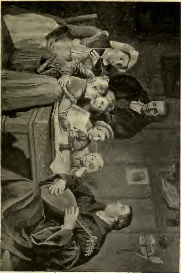
THE FAMILY OF LUTHER.