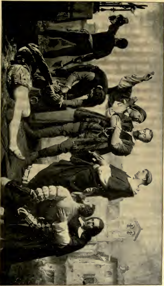
DON JUAN PADILLA ON THE SCAFFOLD.