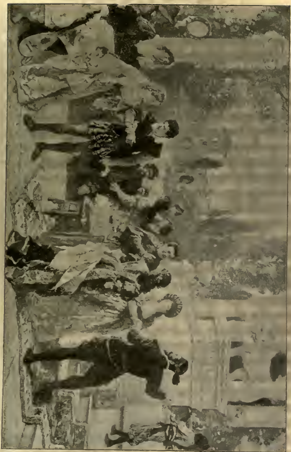
FLORENTINE LIFE UNDER THE MEDICI.