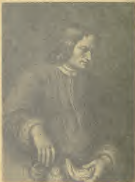
LORENZO DE MEDICI.