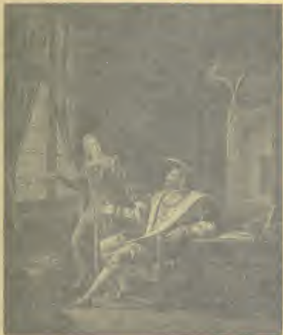
FRANCIS I. AND HIS SISTER MARGARET.