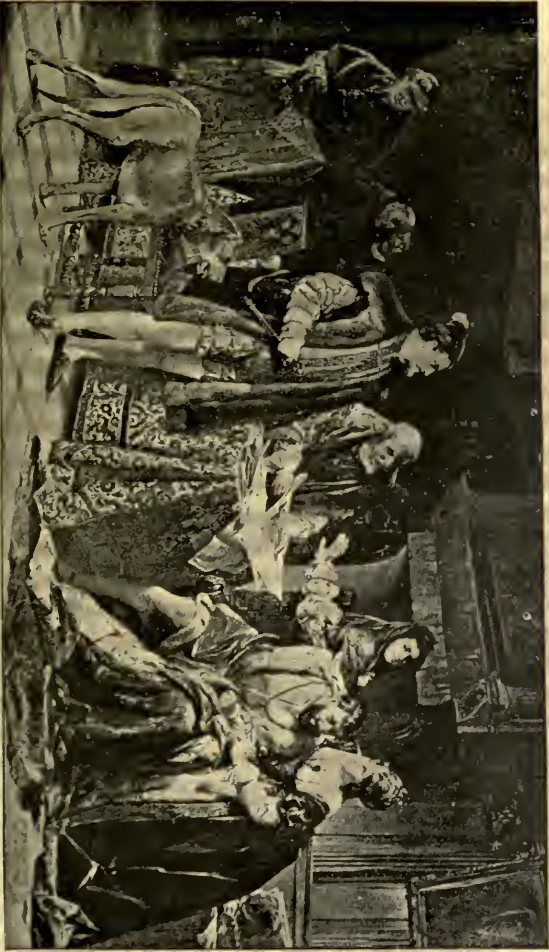
FRANCIS I. REFUSING THE DEMANDS OF THE EMPEROR.