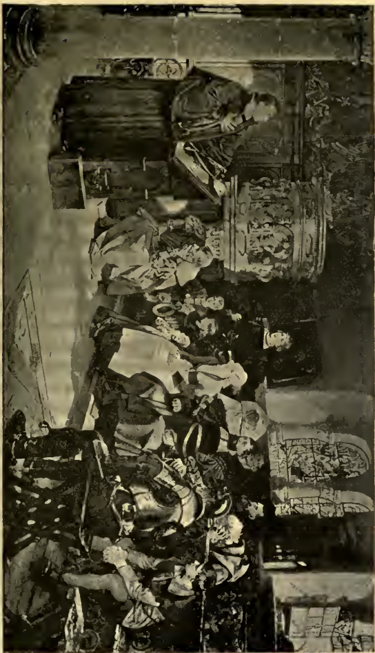
LUTHER PREACHING IN THE CHAPEL OF WARTBURG CASTLE.