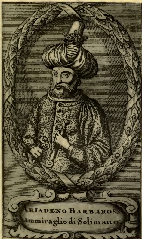
ARIADENO BARBAROSSA Amiraglio di Solimano