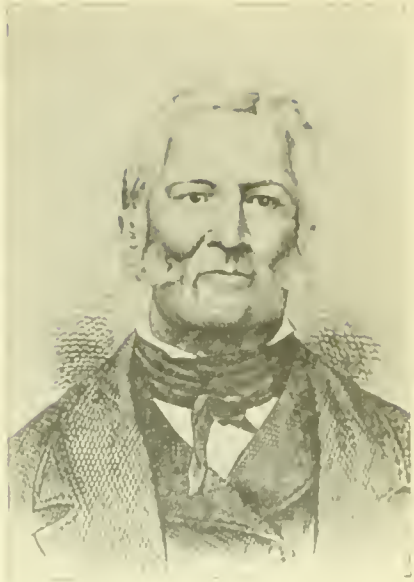
JEAN BAPTISTE FARIBAULT