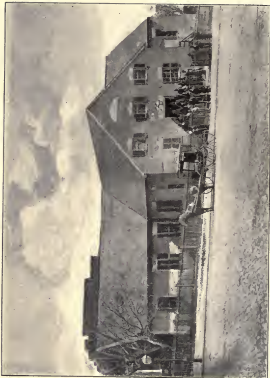
FIRST AFRICAN BAPTIST CHURCH.