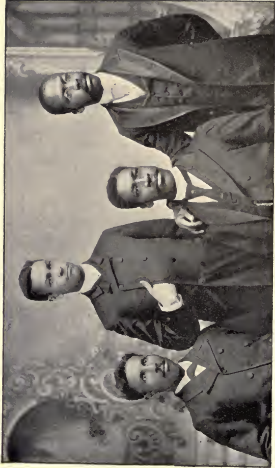
GRADUATING CLASS, RICHMOND THEOLOGICAL SEMINARY.