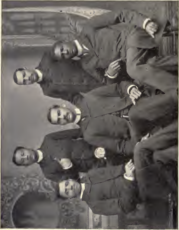
GRADUATING CLASS, RICHMOND THEOLOGICAL SEMINARY, 1892.