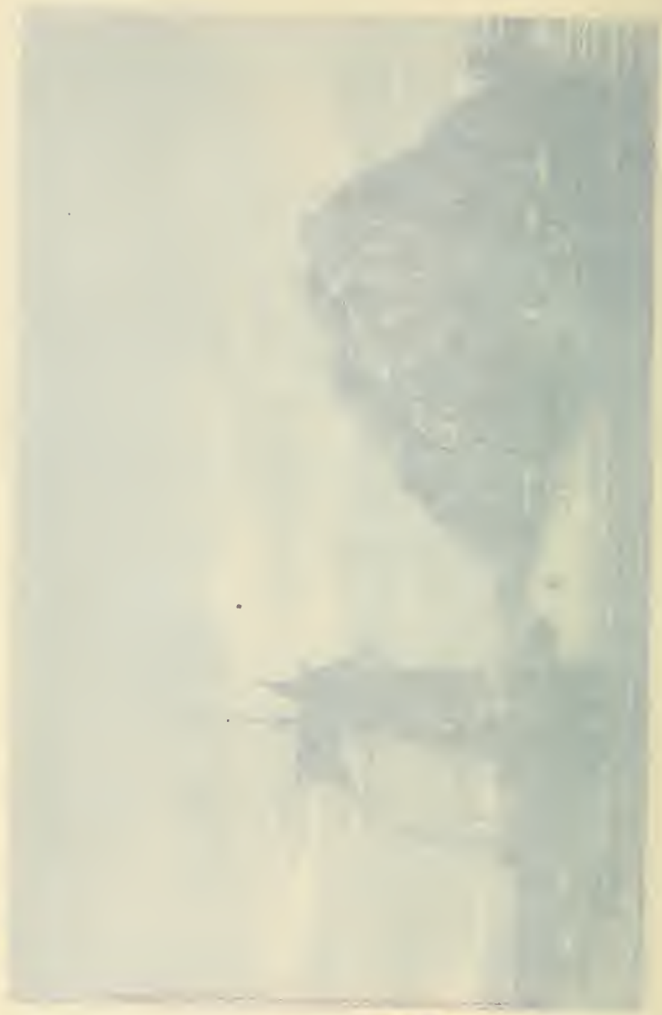
Dumbarton Castle Viewed across from the south side of the loch