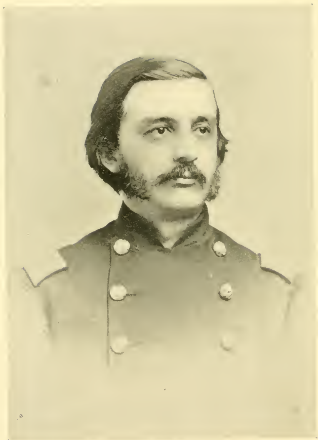
COL. HENRY O. KENT. Colonel 17th New Hampshire Infantry.