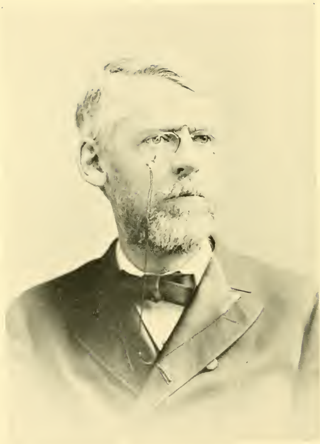
HON. WILLIAM E. CHANDLER.