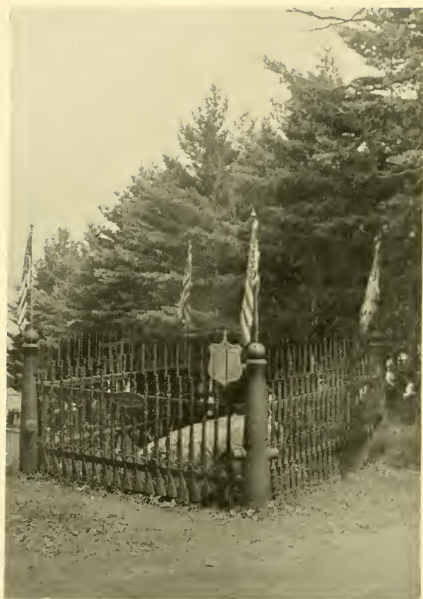
WEIRS MEMORIAL STONE.