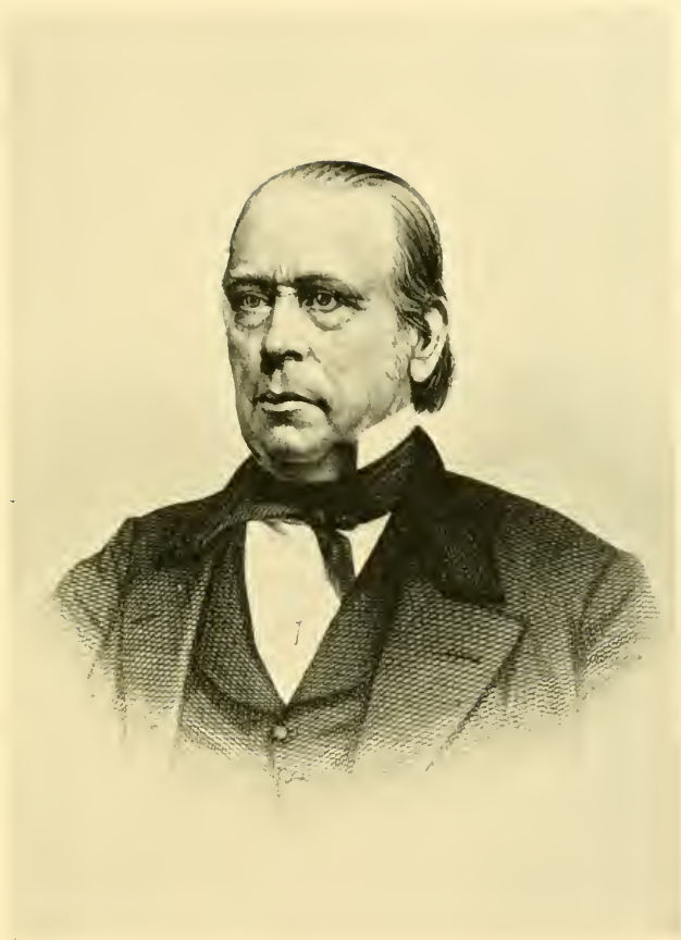
GOVERNOR NATHANIEL S. BERRY.