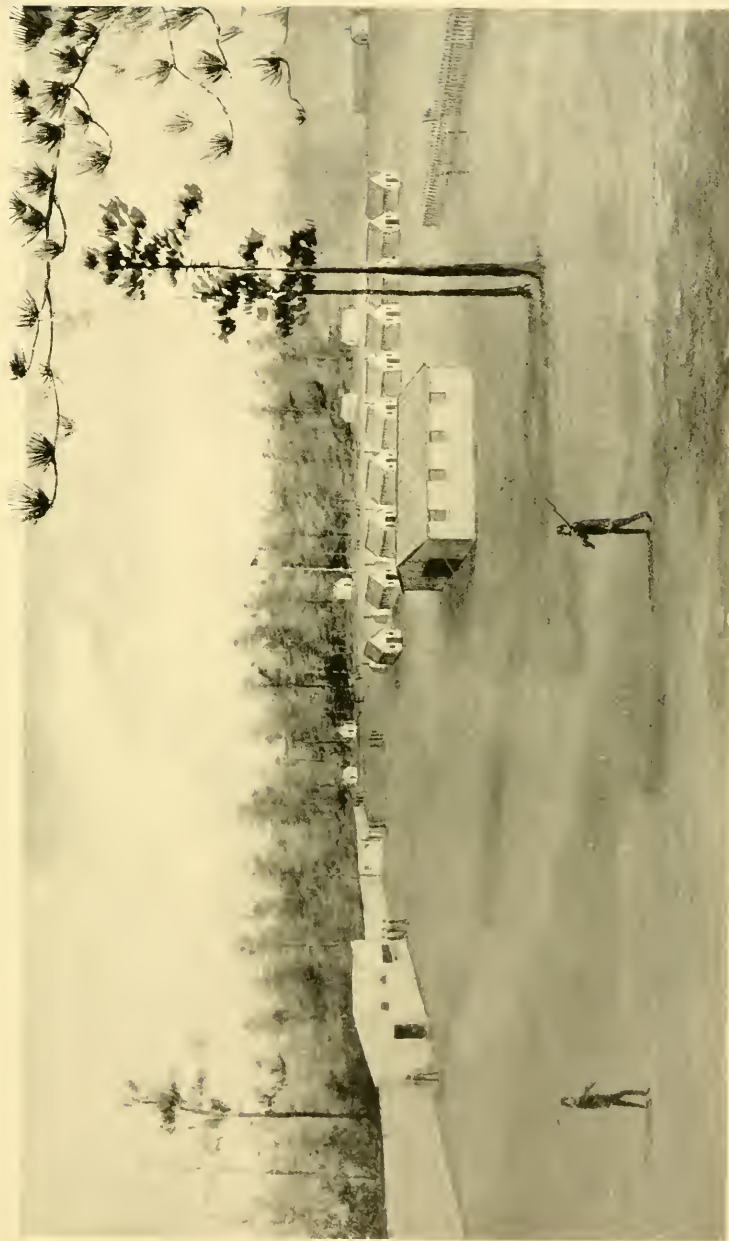
CAMP ETHAN COLBY, Concord, N. H.