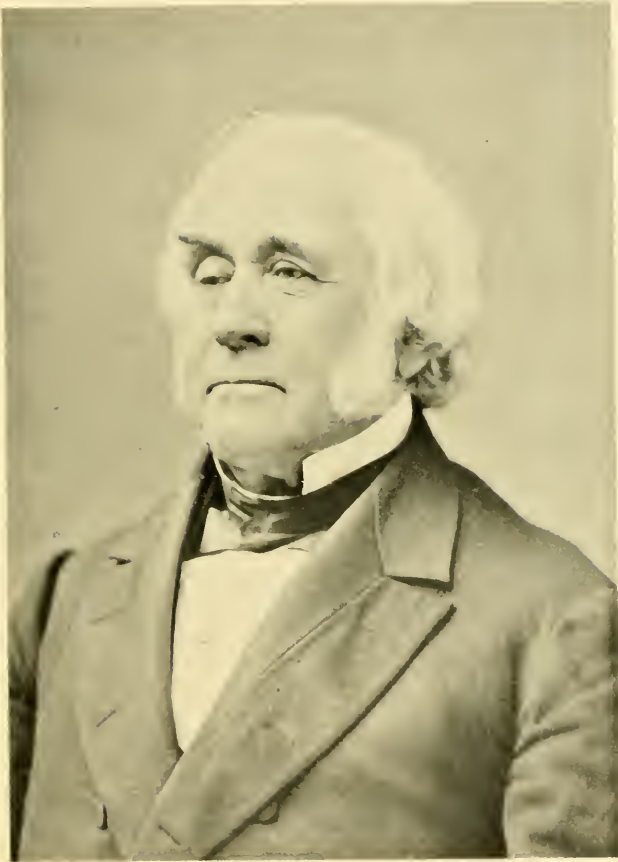
GOVERNOR ICHABOD GOODWIN.