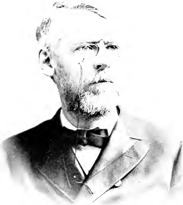
HON. WILLIAM E. CHANDLER.