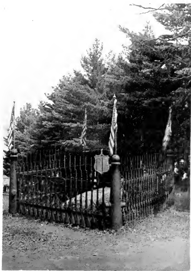
WEIRS MEMORIAL STONE.