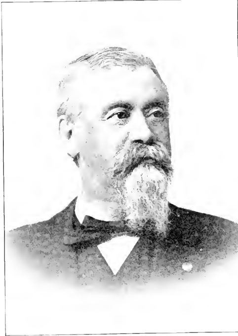
HON. JOHN C. LINEHAN.

Under a special act of Congress, passed in 1861, many of the regiments included in the first call for three hundred thousand men were provided with regimental bands. The men were enlisted, not as privates, but musicians, and could not be detailed for any purpose except field service during a battle, or in the hospital when their