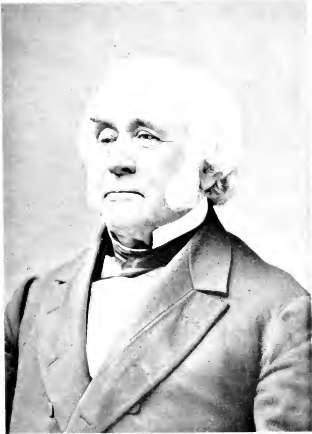
GOVERNOR ICHABOD GOODWIN