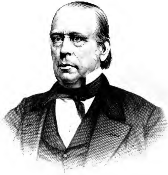
GOVERNOR NATHANIEL S. BERRY.