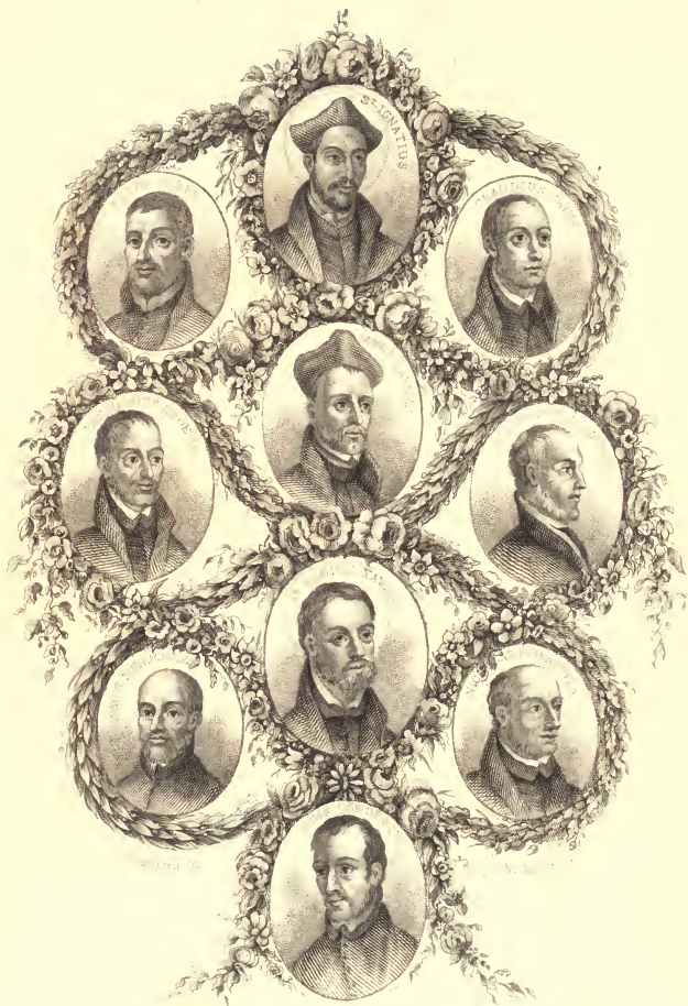
These Portraits are taken from various original drawings and are the property of the Abbess of St Ignatius and the first artist.